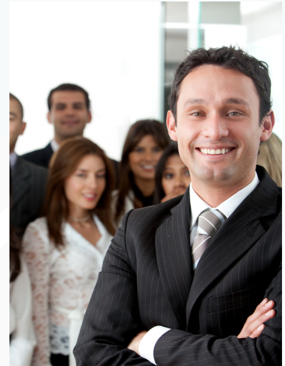
10 ways to get paid

This eliminates the need to grow too fast and too wide. The placement of new distributors helps you structure your organisation in teams while maximising profits.